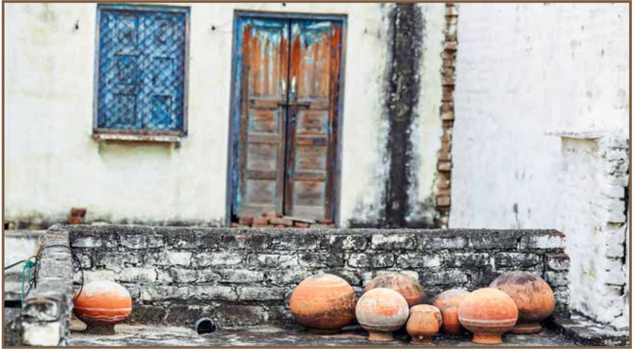
Clay pots in front of a Vrajavasi home

Suppose somebody has offended you. Excuse him. This is also another kind of penance. Lord Chaitanya has taught us: