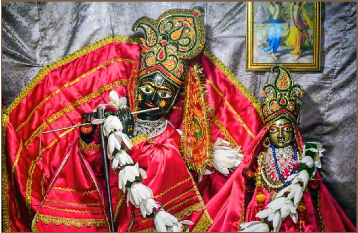
The deities of Sri Sri Radhakant in Javat