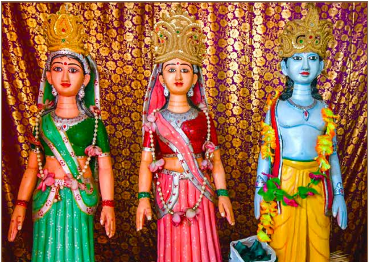
Left to right, deities in Javat: Kutila, Jatila, and Abhimanyu, the so-called sister-in-law, mother-in-law and husband of Radharani