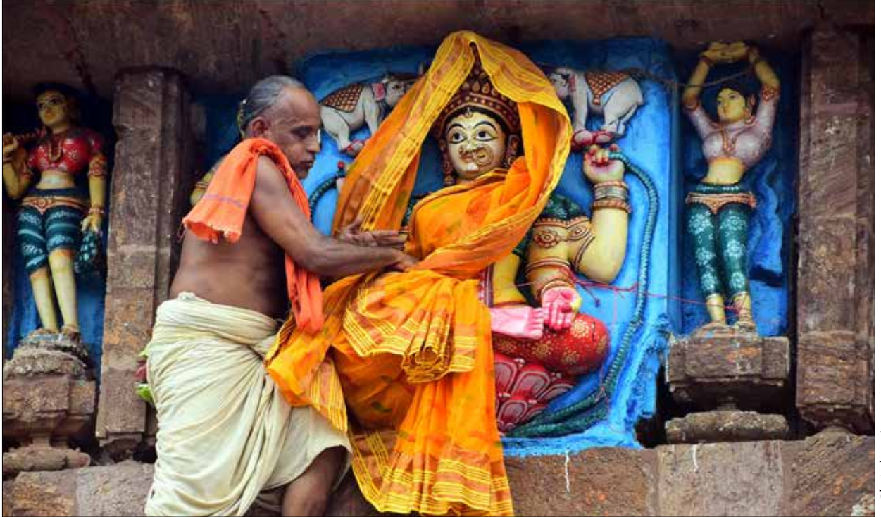
Dressing the deity of Lakshmi inside the Simha-dvāra gate of the Jagannath Mandir

offered, eating only ordinary rice and spinach. The anger builds up inside her for a few days. Then on the pañcamī , Lakshmi is given a bath and dressed with nice ornaments. The pūjā-pāņḍās offer her panti-bhoga .