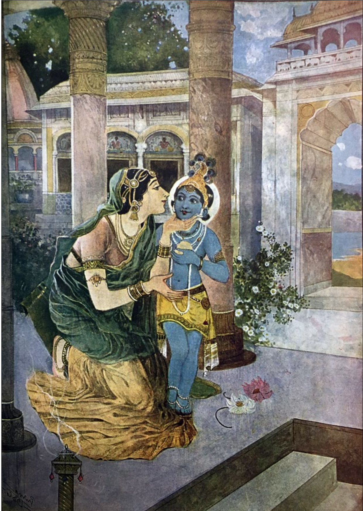
Mother Yasoda and Krishna