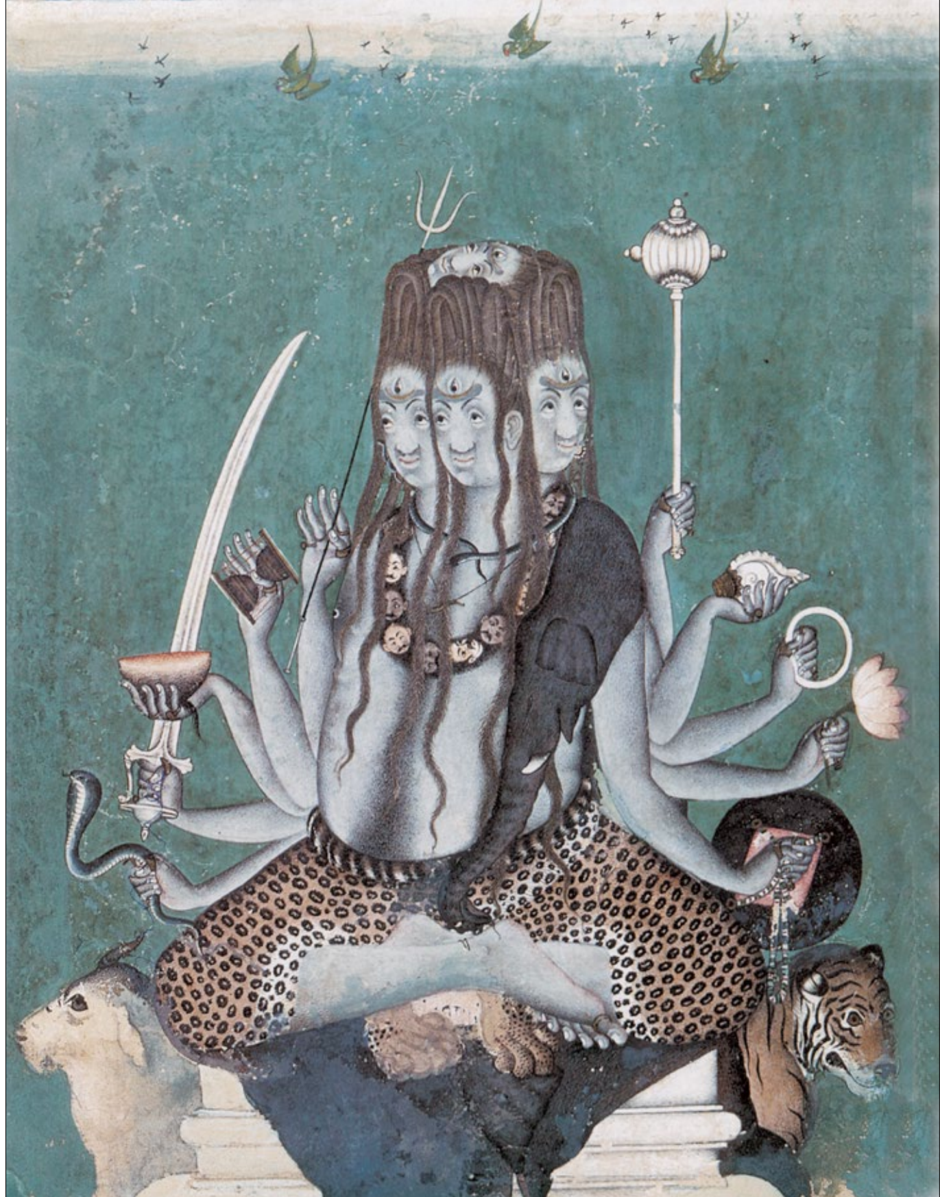
Lord Shiva the greatest vaiṣṇava