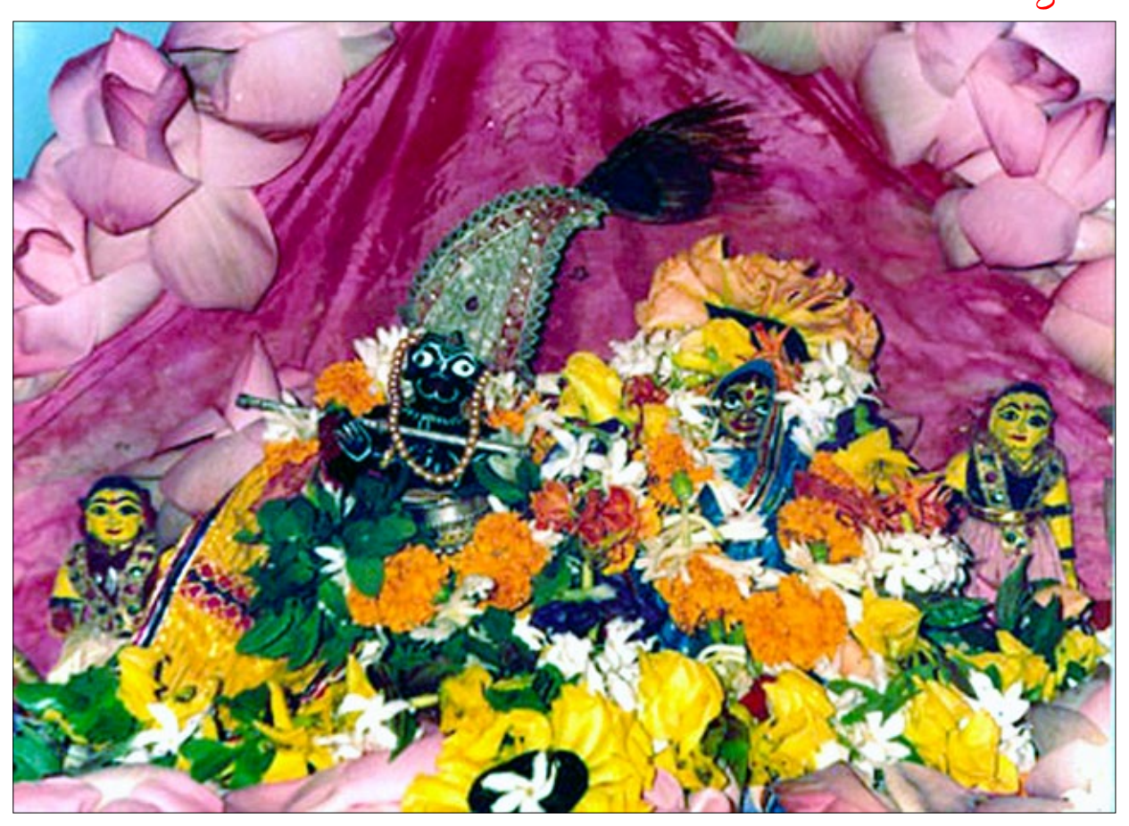
Sri Sri Radha Gopal Jiu with some temporary festival gopīs

Giri touches you it will be healed, otherwise you cannot be cured. You go there at once, don't make any delay."