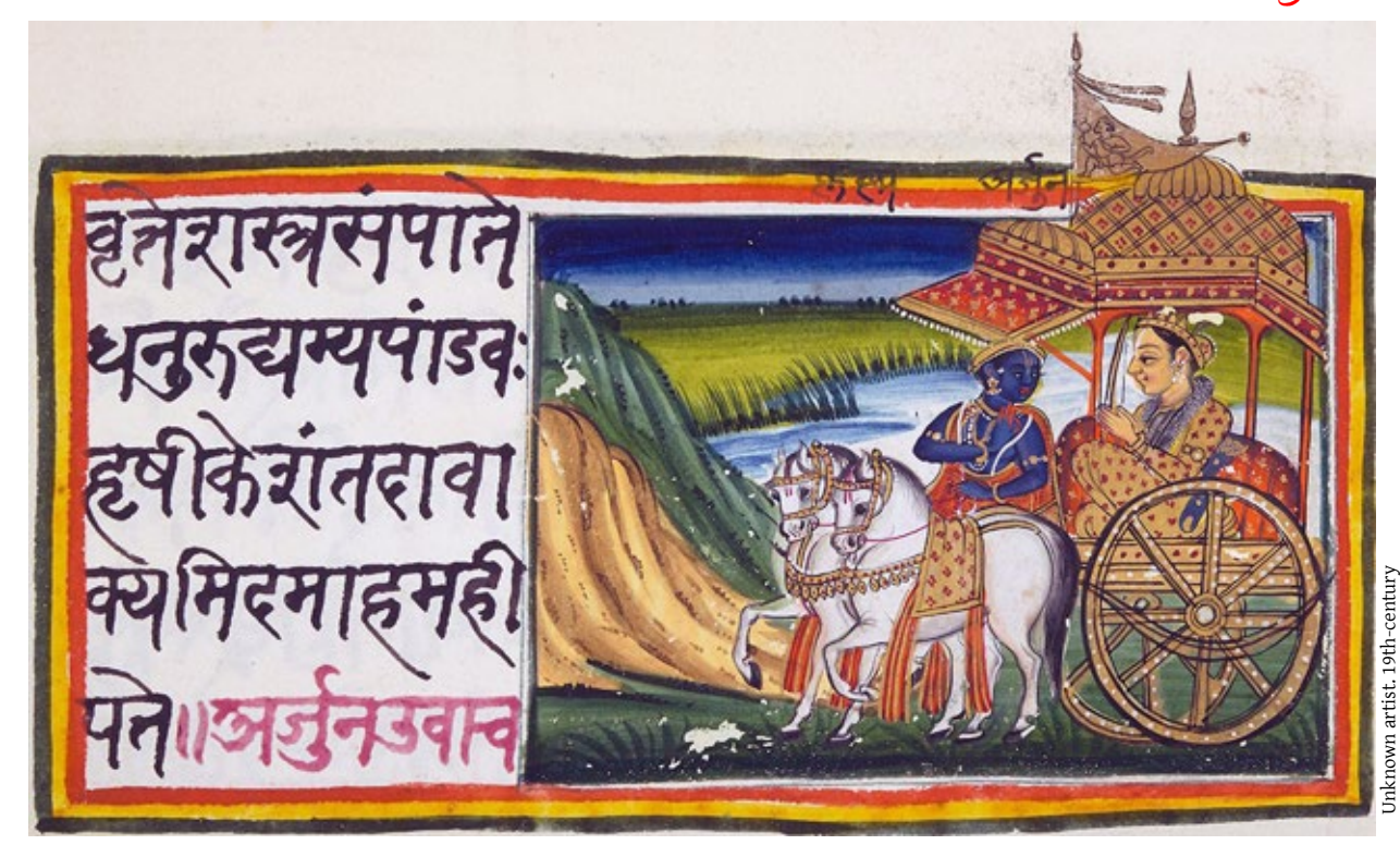
Krishna speaks the Bhagavad-gītā to Arjuna

their pious activities, and offered the results of some of those activities to that bull. In that crowd there was also one prostitute who did not know if she had ever performed any pious activities, but seeing everyone else, she also offered the results of any pious activities she might have performed. After that, the bull died, and was taken to the abode of Yamaraj, the god of death.