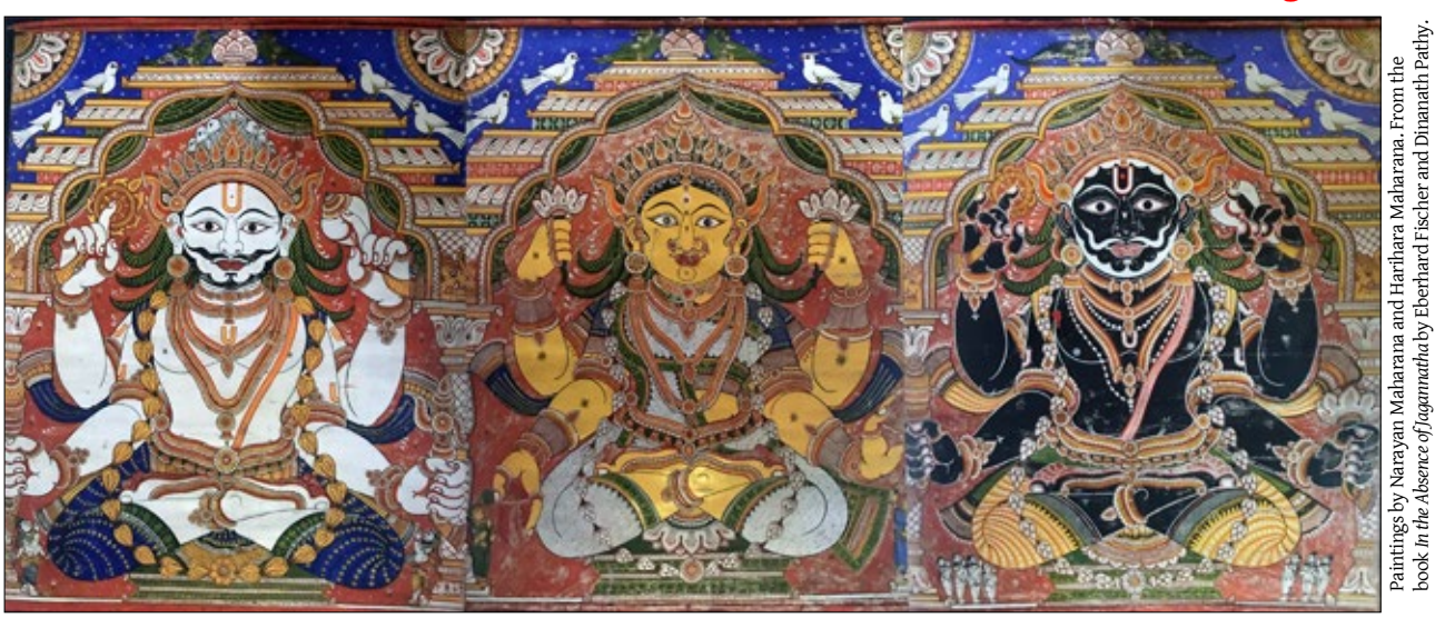
The Anavasara-paṭi paintings of Jagannath, Baladev, Subhadra that were worshiped as deities in the Puri temple in 1990

deities is complete, the Datta-mahapatra citrakāras wrap the deity with special ropes, cover them with cloth, and finally paint their features. This ceremonial painting of the deities is known as banaka-lāgi.8