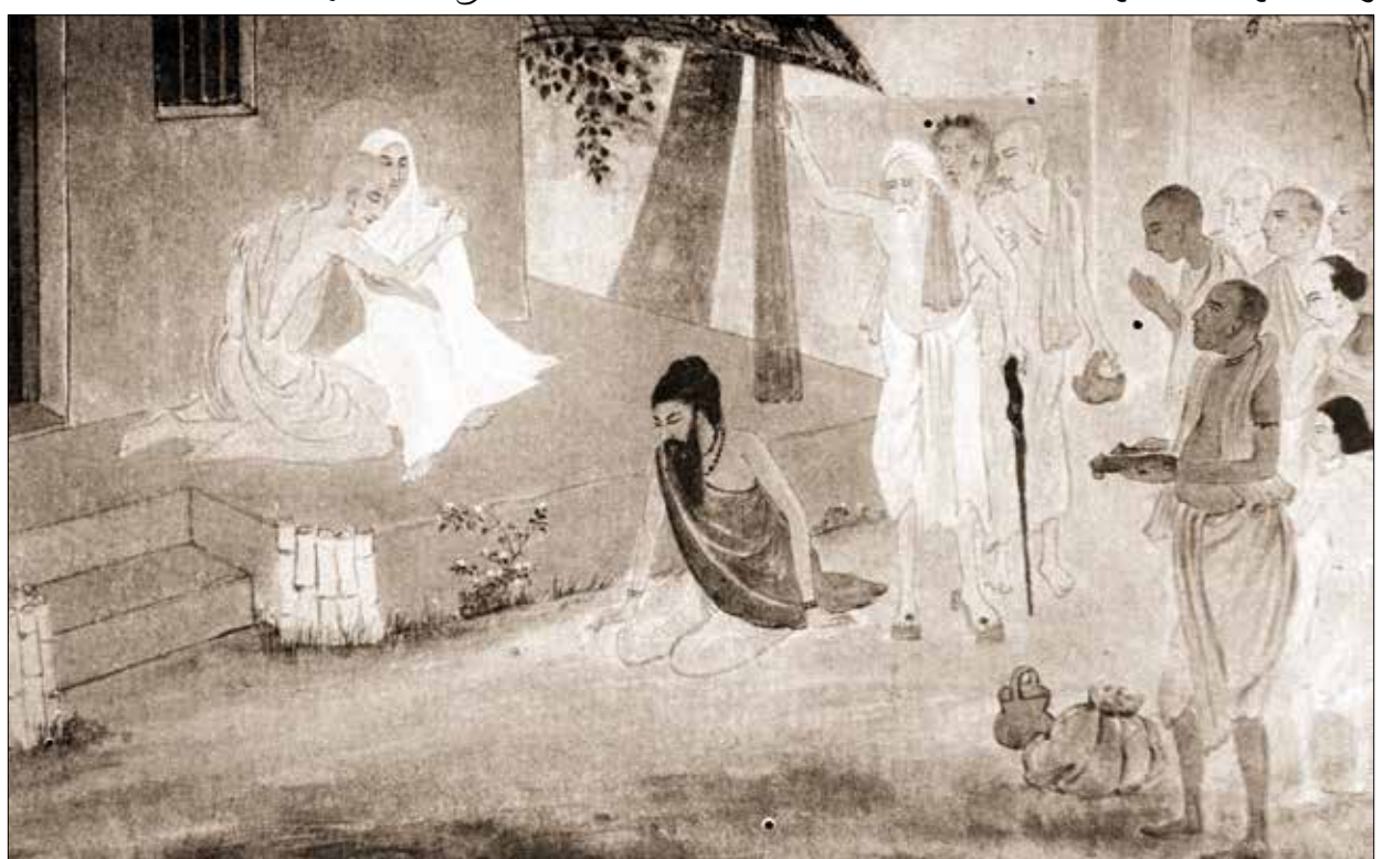
Nimai embraces his mother after taking sannyāsa

ei mate kali-pāpa kariba samhāra sabhe cala — āge pāche nā kara vicāra