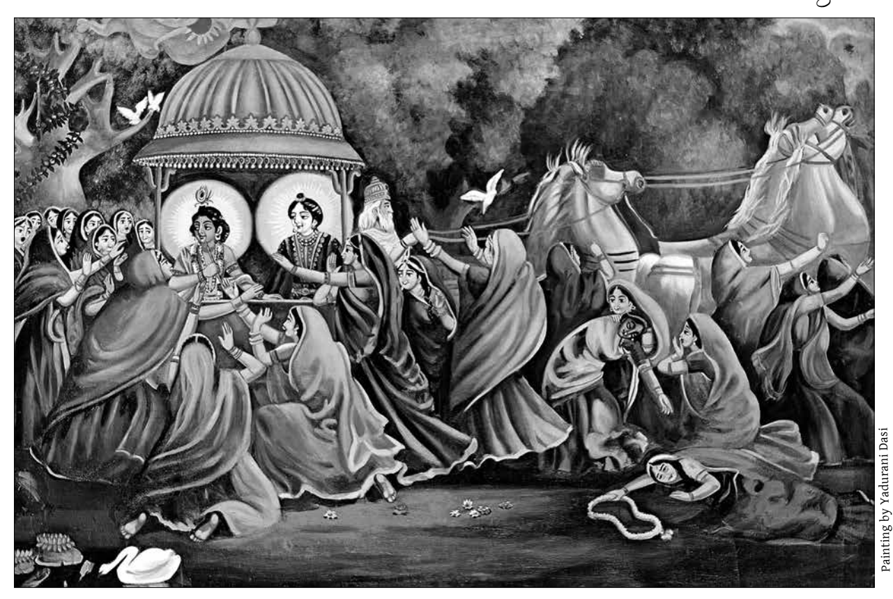
Krishna leaving Vrindavan

Other emotions they were poignantly experiencing included the fact that although they were so very, very happy to be reunited with Krishna, they were unhappy with the opulent, regal atmosphere present there at Kurukshetra.