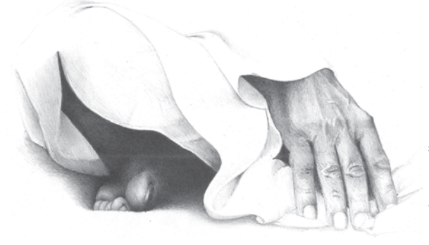
The lotus feet and hand of Srila Prabhupada