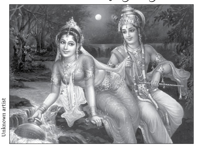
Radha draws water from the Yamuna

The universality of bhakti can also be seen by observing the auspiciousness that all agents of the activity of bhakti receive. This is seen in the histories given in the various purānas. For example: