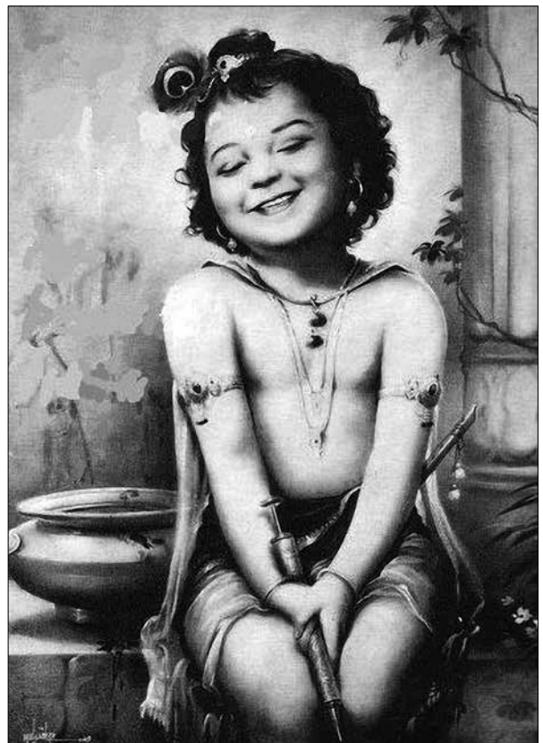
Krishna laughs as he plays holi

attributes yet without attributes. [In short, he contains all opposing qualities.]