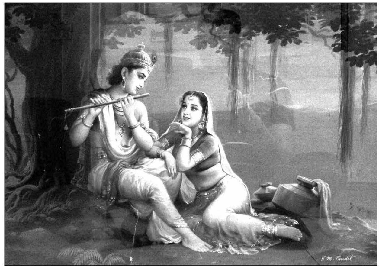
Radha and Krishna on the bank of the Yamuna

the presiding deities of these sacred places have disappeared. In such a precarious condition, Krishna is my only refuge (3)