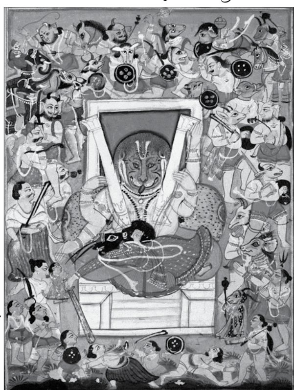
Nrisimha kills the daitya-king while Hiranyakasipu's army attacks

diśyāt sukham naraharir bhuvanaika vīro yasyāhave diti-sutoddalanodyatasya krodhoddhatam mukham avekṣitum akṣamatvam jāne 'bhavan nija-nakhesv api yan natās te