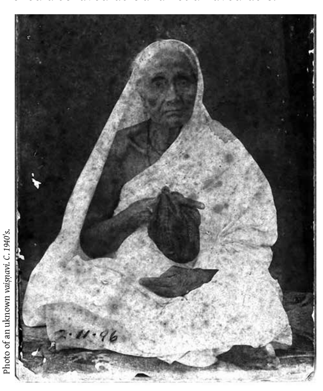
Prayer should be done in a mood of full dependence on the Lord

Summary of Commentaries: The devotee should give up the false pride that the Lord did not fulfil his or her desires and therefore think, "Let me give up his service and go back to material enjoyment." In all circumstances, one must feel completely dependent on the Lord. This feeling of dependence should be favourable and not unfavourable.