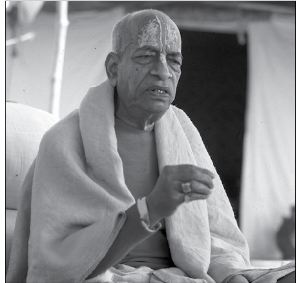
His Divine Grace A. C. Bhaktivedanta Swami

— From a conversation in Sandau, 26 December 1975.