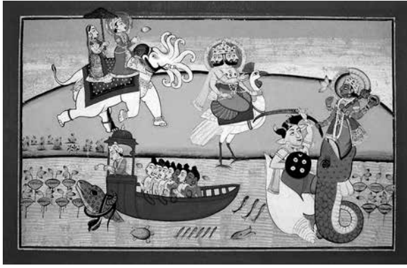
Matsya kills the demon Sankhasura and rescues the Vedas

Illustration from Matsya Purāṇa, Mewar, c. 1840