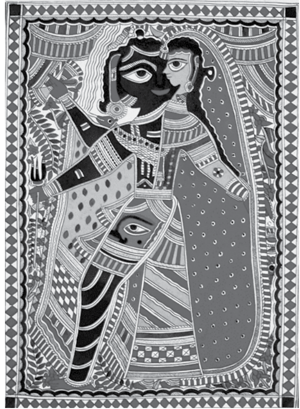
Unknown artist. Mithila style

Radha-Krishna are eternally one and different