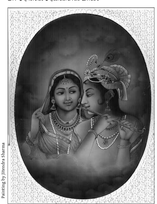
pītam harer vadanam abja-rasam prasahyāpy āsām dṛśā racita-bhṛṅga-cakora-bhaṅgi tenāpi satkṛtim amanyata sa praśastām ājīvyatām qatavatīsu tad āsu yuktam

rādhā bādhā-pratihata-tanuḥ sarvadā dhāraṇābhiś citte śāntīr api nidadhatī vyākulāsīd atīva hā hā tasyāḥ priya-savayaso 'py āśu tad-bhāva-bhāvāt tām evāpuḥ kaṭutara-daśām hanta ke 'mūm avantu