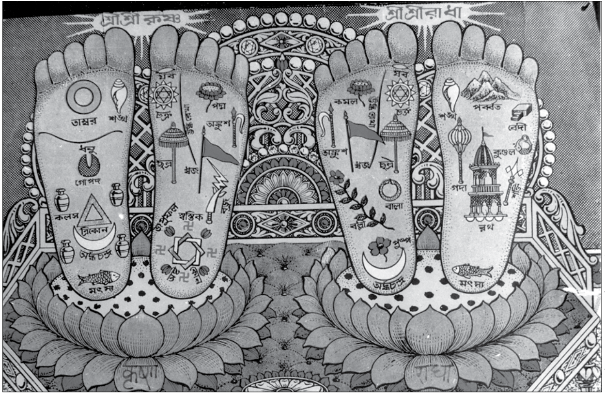
Unknown artist. Bengali, c. 1950's.