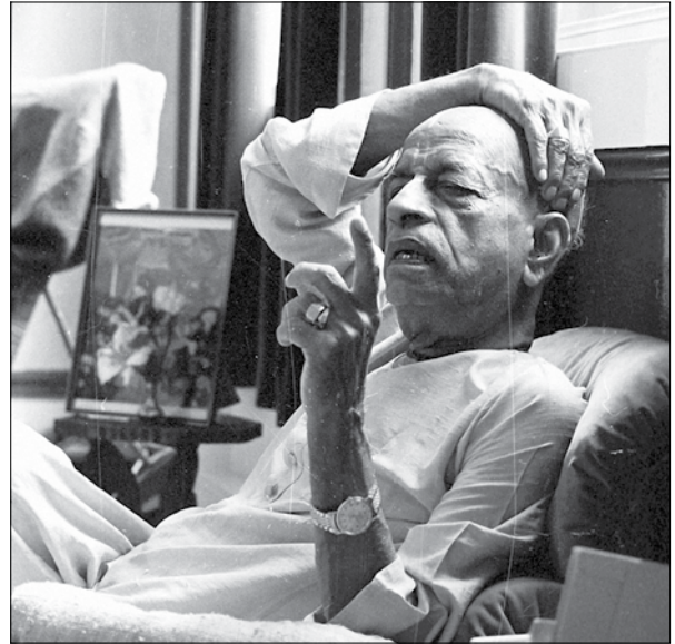
His Divine Grace A. C. Bhaktivedanta Swami Prabhupada

Marriage between husband and wife means that the husband must forever be responsible for the wife's well-being and protection in all cases. That does not mean that now there is agreement between us,