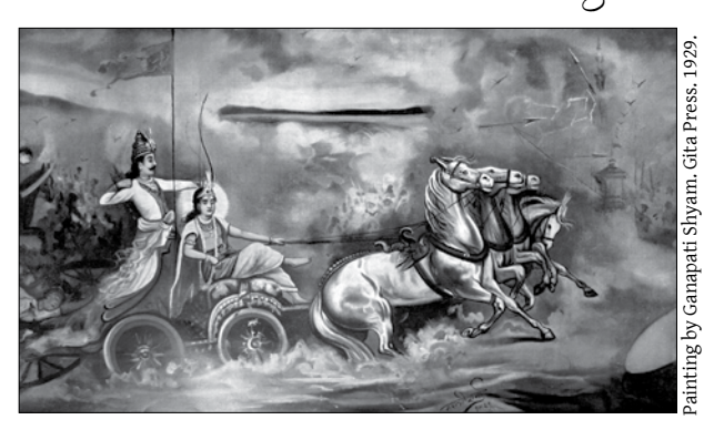
Krishna and Arjuna

Srila Sridhar Swami [an explanation from the karma-yoga point of view]: kuta ity apekṣāyām ubhayor vaiṣamyam āha vyavasāyātmiketi. iha īśvarārādhana-lakṣaṇe