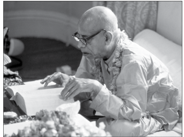
His Divine Grace A. C. Bhaktivedanta Swami Prabhupada

The Supreme Lord descends in the form of bhāgavata-kathā . The bhakta-bhāgavata speaks bhāgavata . He is the embodiment of bhāgavata . We hear this word " bhāgavata " in two places — grantha-bhāgavata and bhakta-bhāgavata — the book bhāgavata and the devotee bhāgavata . The Supreme Lord gives bhakti-rasa through these two bhāgavatas . Caitanya-caritāmṛta (ādi 1.100) states: