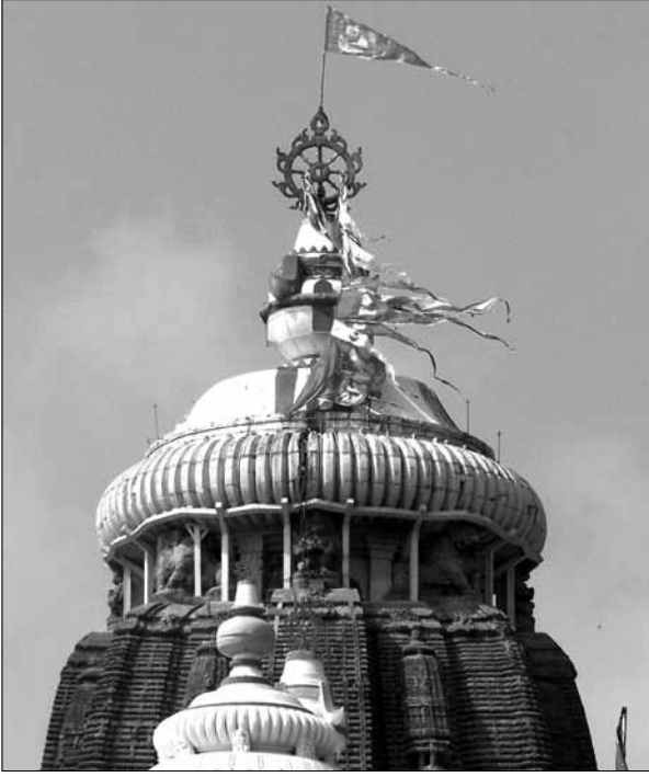
Flags over the Jagannath Temple in Puri

day he died. Ever since that time she had been wandering in the forest until she one day came to where I was staying.