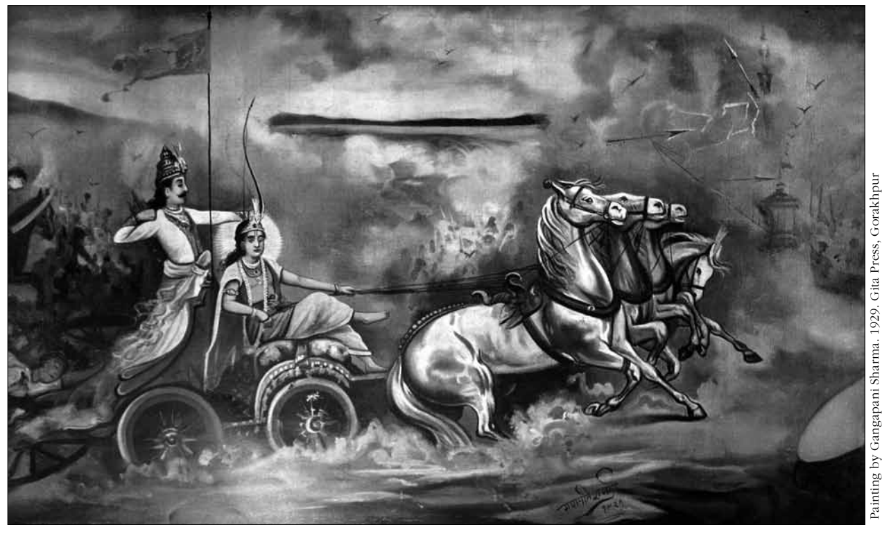
Krishna and Arjuna on the battlefield of Kurukshetra

So read Bhagavad-gītā and hear Bhagavad-gītā from that guru. Then all questions are answered; no question is left out. One should know that tattva-vastu (object of truth).