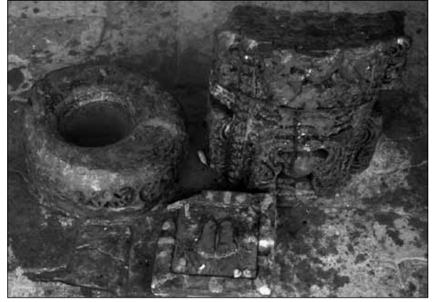
Ancient grinding mortar in Gokul Vrindavan said to have been the original one to which Yasoda bound Krishna

Rupa Goswami writes that although śṛṅgāra-rasa is broad-limbed, he is describing it only in brief. He specifies the reasons for doing so in this verse: Those who are totally detached ( nivṛtta ) consider this rasa