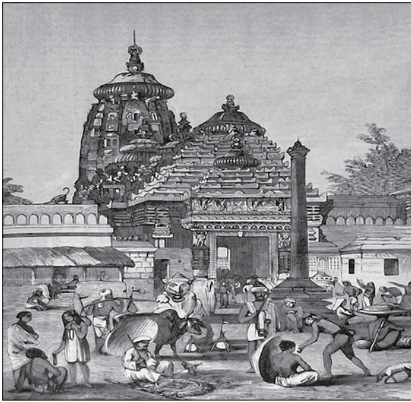
Jagannath Mandir in Puri, c. 1830

offer flowers, fruits, etc., to the deities. Then on the eighth day the Lord returns to his own place. This is the system, and care is taken to ensure that the great procession is complete with chanting, flowers, etc. If during ratha-yātrā you cannot keep the festival on the seaside then take the cart in procession to the river-side and come back on the same day. For the eight days, as far as possible, distribute prasadam , especially khicari . Then on the eighth day you also organize the ceremony in the same way. Please arrange to take nice photographs of your festival activities as well as of your other kīrtana activities. (Letter to Jayapataka. 21 June 1969.)