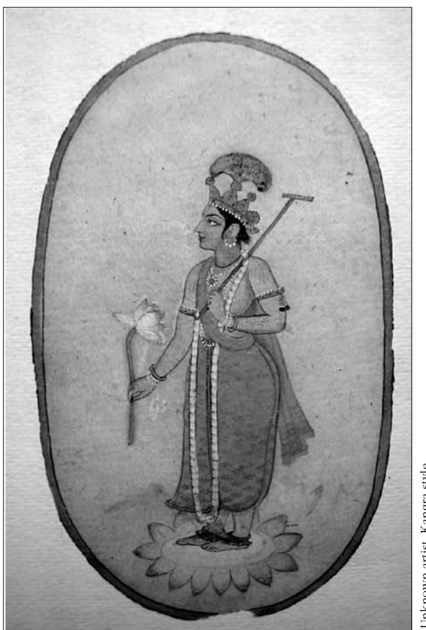
Balaram with a lotus and plow

Yamuna Devi begged, "Please be merciful to me. Please give up your anger and forgive me."