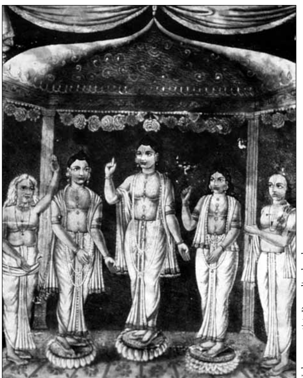
Sri Pancha Tattva

ānande nitāi mālī sei phala pādīyā dīna-duḥkhī jane deya duhāte vilāñā