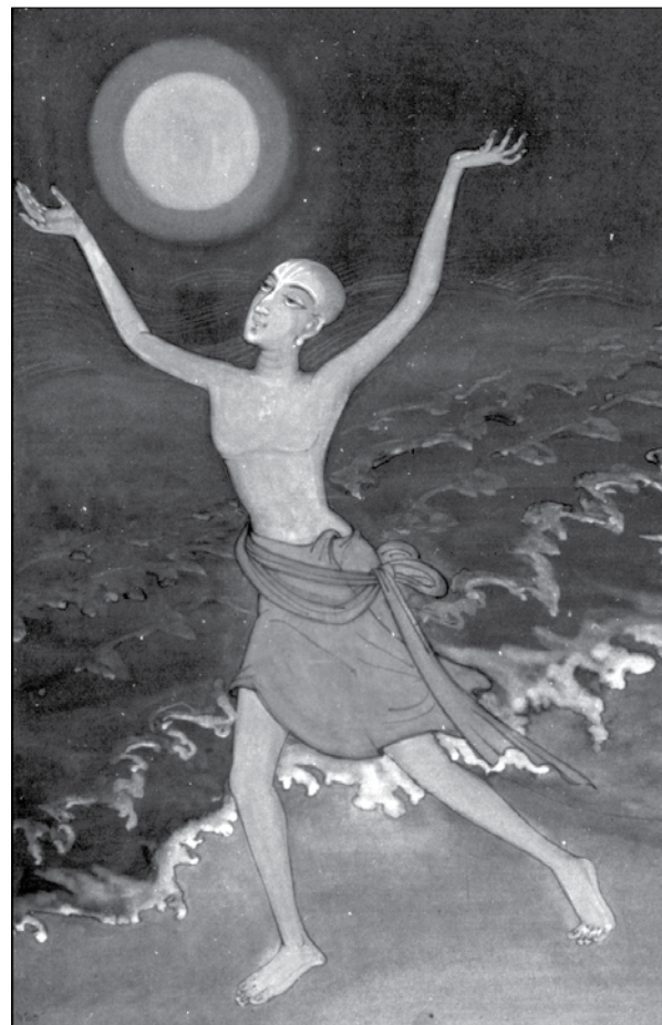
Sri Chaitanya Mahaprabhu in Jagannath Puri