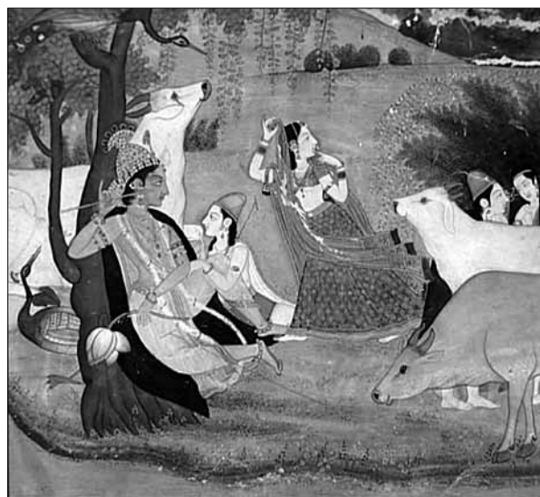
Krishna in Vraja

Quotations from the books, letters, and lectures of His Divine Grace A. C. Bhaktivedanta Swami Prabhupada ©Bhaktivedanta Book Trust International. All other materials, unless specified, © ISKCON Bhubaneswar/Gopal Jiu Publications. All rights reserved. Blanket permission is given to redistribute Bindu in electronic or print form provided no changes are made to the contents.