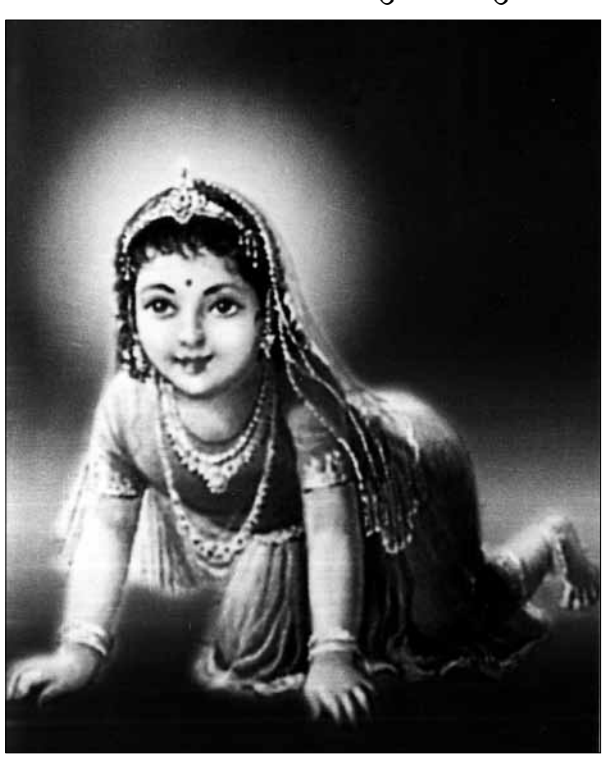
The beautiful daughter of Maharaja Vrishabhanu