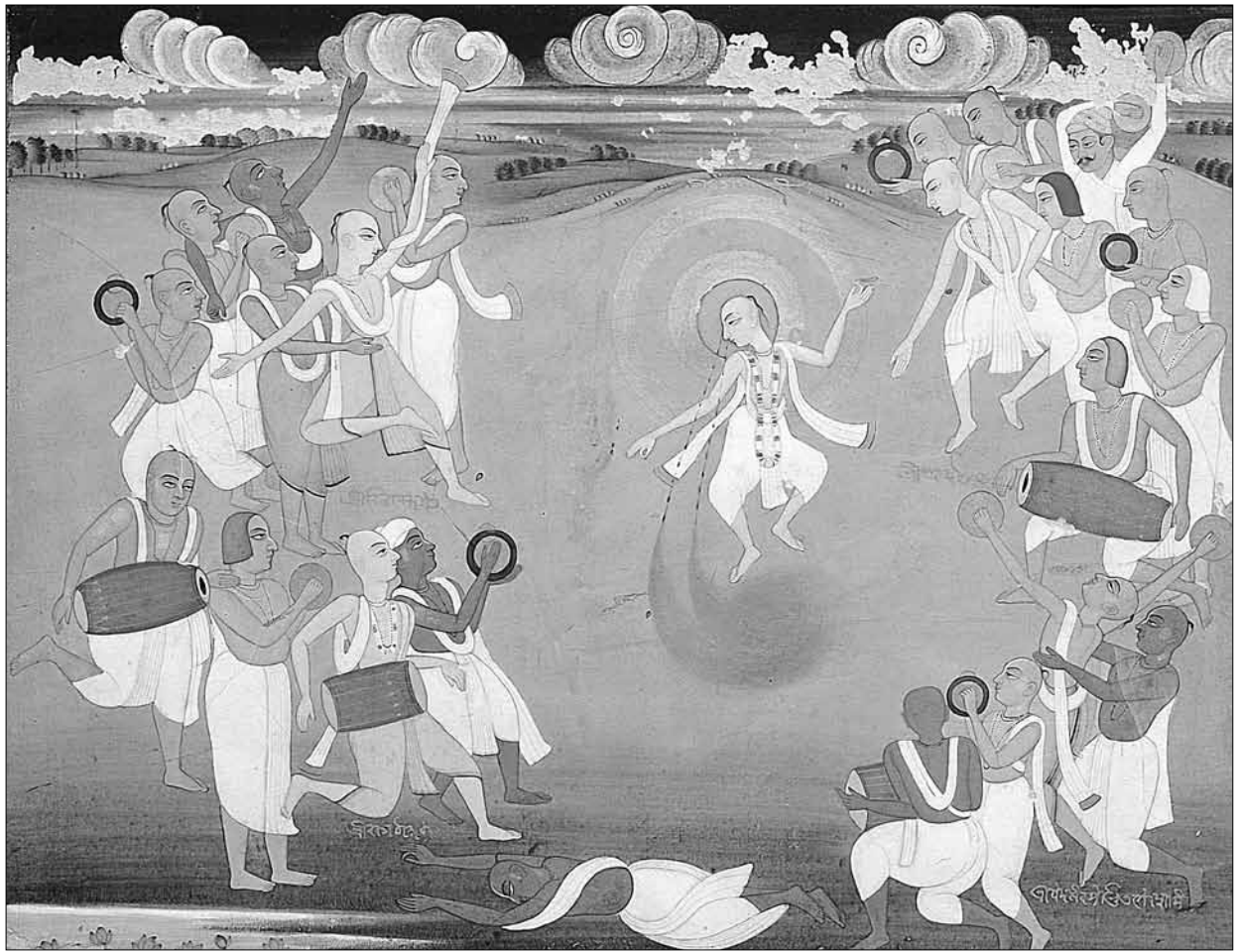
Sri Chaitanya Mahāprabhu's prema-nāma saṅkīrtana

The premi-bhaktas perfectly understand the purport of the scriptures, and according to the situation they may sometimes act contrary to specific scriptural injunctions. Seeing this, ass-like people may call them misbehaved. Sectarian people who see that they are not decorated with the signs of a sect conclude that they are irreligious. Logicians who see their loving dealings may consider those dealings unreasonable. Dry renunciates who see their physical and family endeavors may mistakenly consider them as attached to their house or body. Persons attached to material enjoyment who see their detachment from work may suspect that they are inefficient. jñānīs who see their indifference towards impersonalism may consider them unreasonable. Materialists may consider them mad. But actually they are fully independent and spiritually situated. For all such people, the premi-bhaktas are aimless and incomprehensible.